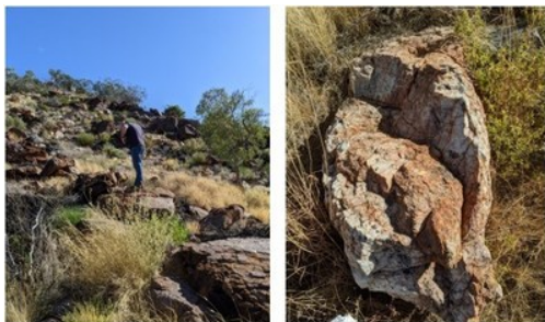
FIGURE 1: OUTCROPPING RIDGE OF QUARTZ VEINING /ALTERED COUNTRY ROCK

During the visit, 12 rock-chip samples were taken which represent the veining and immediate country rock of some of the ridges observed in the tenure. Notably, the technical team believe mineralisation could occur in either the quartz veining and/or the altered country rock.