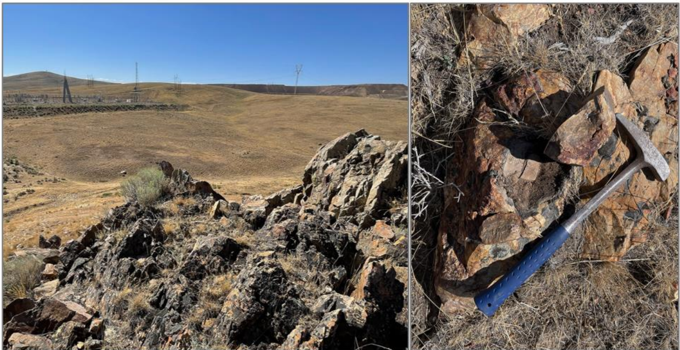
Figure 2: Surface Exposures of Silicified Fault Breccia