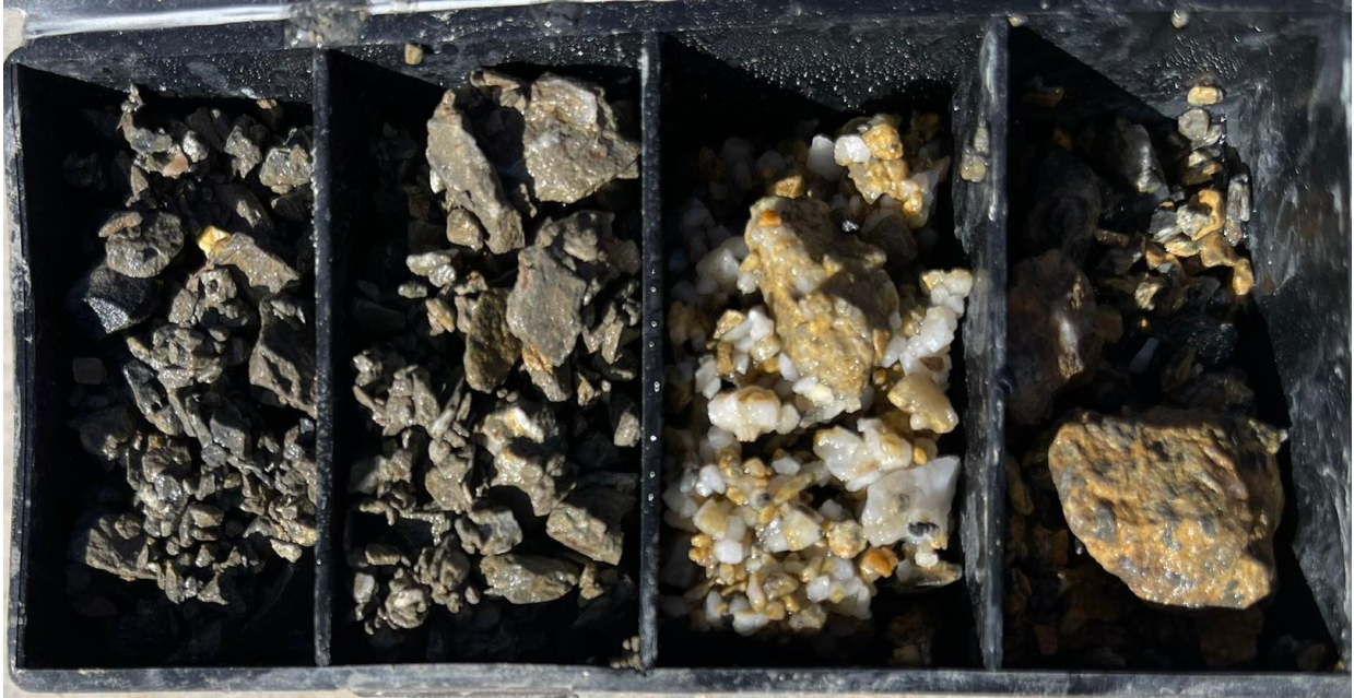
Figure 5: T2208 - Reverse-Circulation Chips – Silica & Breccia Associated with Intrusive Rocks

Reverse-circulation chips collected from T2208 show five distinct intervals of intrusive rocks with associated silica and breccia (see Figure 5 below). This included an interval ending at a depth of ~300 meters, deeper than in any previous drilling. In addition, zones of decalcification (varying from moderate to strong) were observed which were up to 15 meters wide.