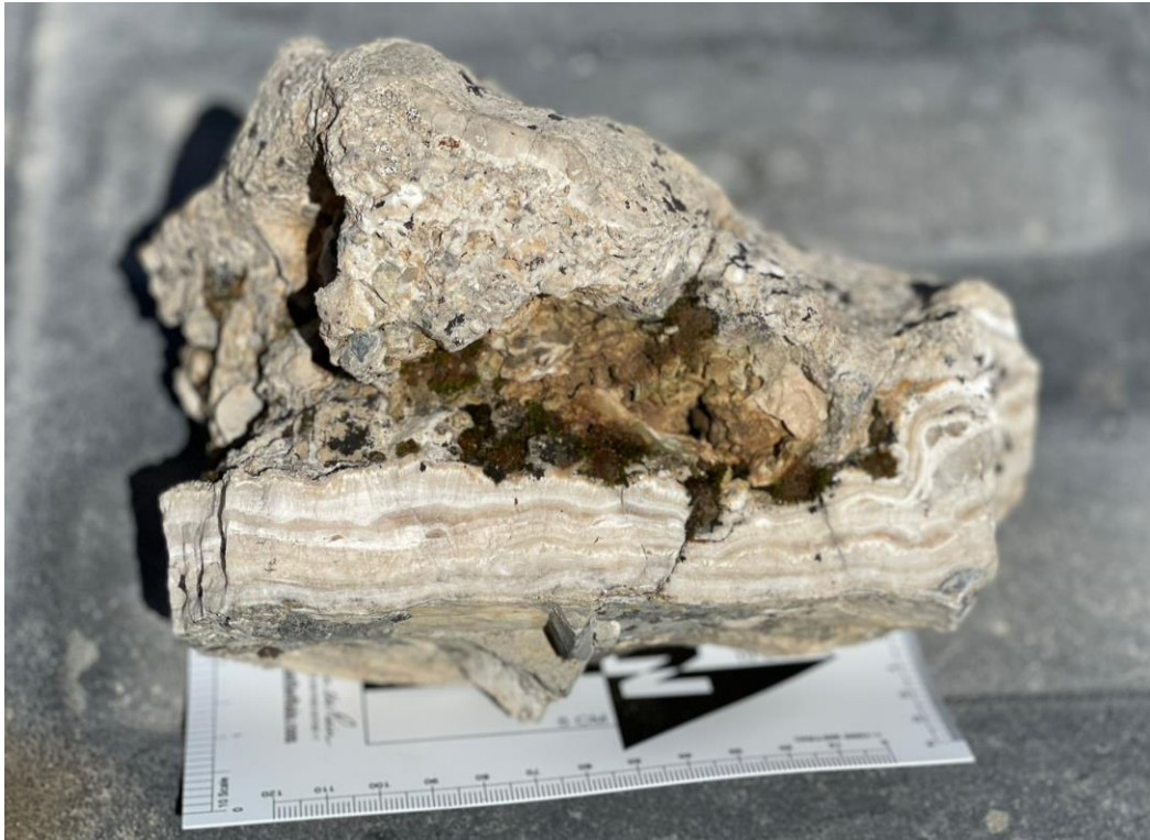
Figure 4: TSD Zone - Hydrothermal Calcite Sample at Surface

Very few holes in previous drill campaigns (2) reached a sufficient depth to properly test the SSD Zone (only 16% of all legacy holes identified on the property reached 180+ meters). Three notable holes within the footprint of the Historical Estimate intersected thick, tabular, disseminated gold developed in the SSD Zone, which occurred at a similar depth horizon indicating lateral continuity. These intervals are beneath the Historical Estimate and did not contribute to the estimated tonnage and grade at that time.