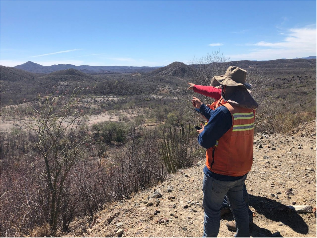
Photo 1. Geologists Overlooking the Pilar Property.