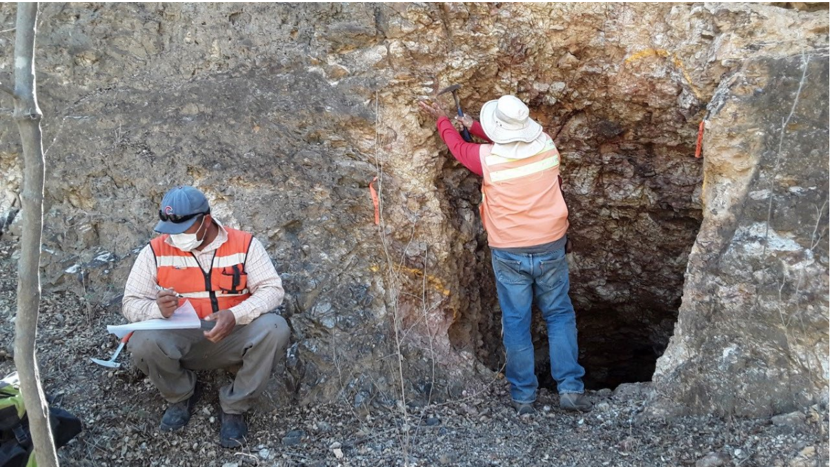
Photo 2. Geologists sampling along mineralized corridors that include historic adits and shafts.