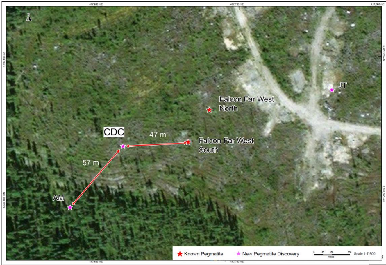
Figure 2: Location of five spodumene-bearing pegmatite showings over a 300m by 500m area