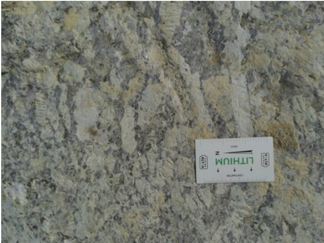
Figure 2. Large spodumene crystals in the AM pegmatite

To view an enhanced version of this graphic, please visit: