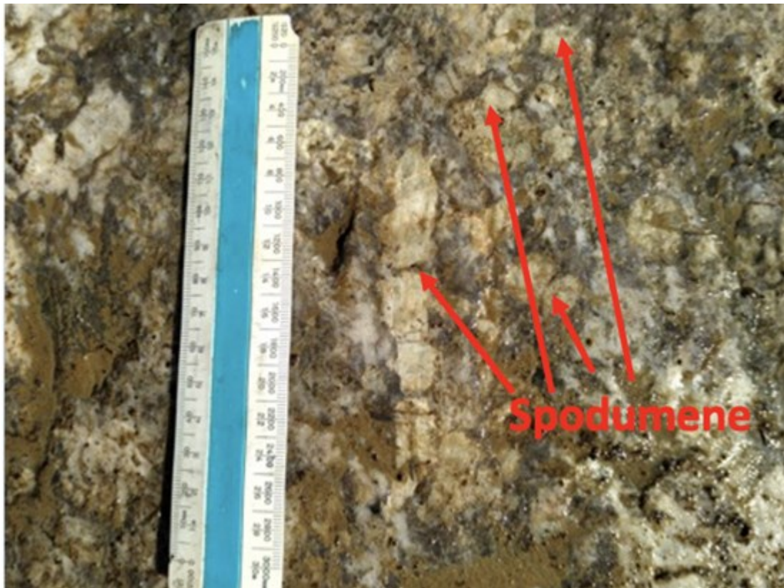
Figure 3. Large Spodumene crystals in the newly discovered JT pegmatite showing

To view an enhanced version of this graphic, please visit: