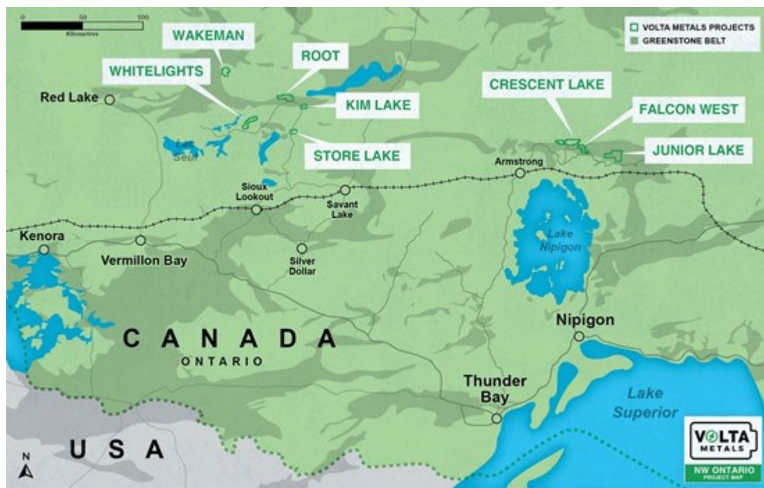
Figure 1. Volta Lithium properties in northwest Ontario

Toronto, Ontario--(Newsfile Corp. - July 26, 2023) - Volta Metals Ltd. (CSE: VLTA) (" Volta " or the " Company ") is pleased to announce that it has signed a Memorandum of Understanding (MOU) outlining a framework for collaboration on the Phase 1 Exploration Program for Falcon West, Crescent Lake and Junior Lake Lithium Projects with Whitesand First Nation ( Figure 1 ).