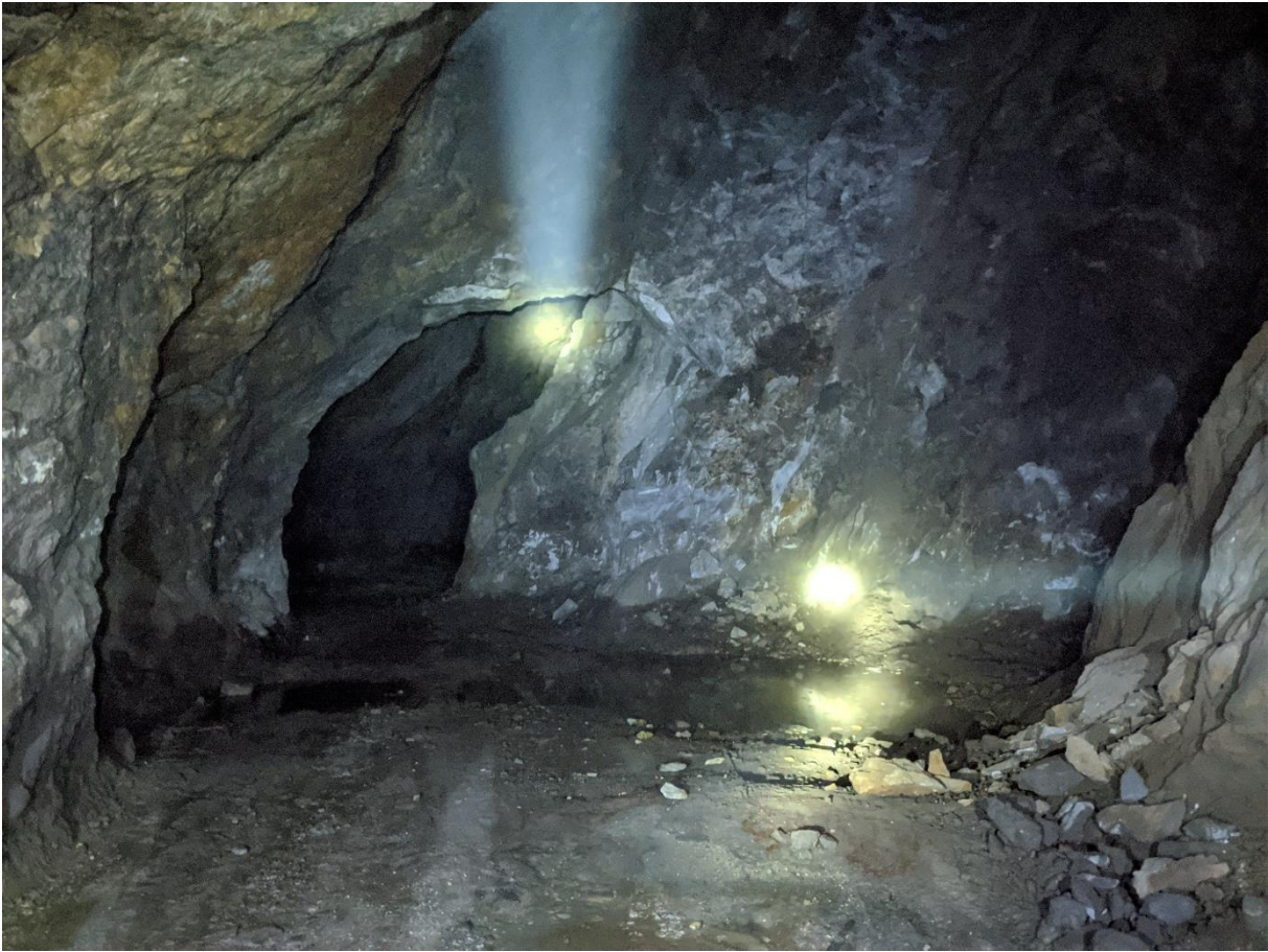
Images from the mining site