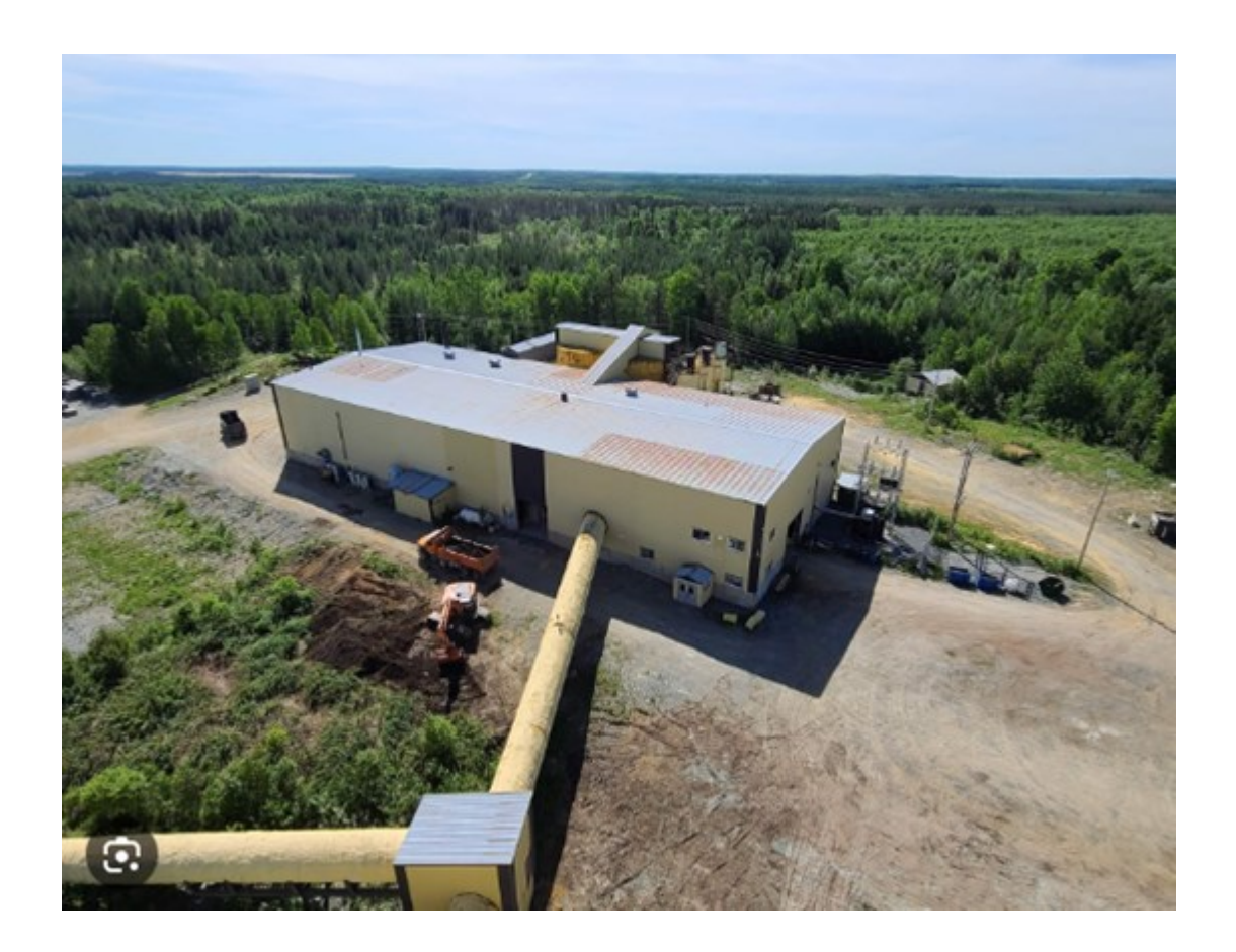
Figure 1: Photos of Beacon Mill and Property currently under care and maintenance

To view an enhanced version of this graphic, please visit: <a href="https://images.newsfilecorp.com/files/6526/223993">https://images.newsfilecorp.com/files/6526/223993</a> 7b16b73d74abb82b 001full.jpg