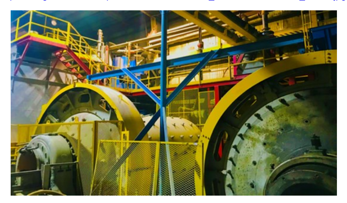
Figure 2: Photos of Beacon Mill and Property currently under care and maintenance

To view an enhanced version of this graphic, please visit: <a href="https://images.newsfilecorp.com/files/6526/223993">https://images.newsfilecorp.com/files/6526/223993</a> 7b16b73d74abb82b 001full.jpg