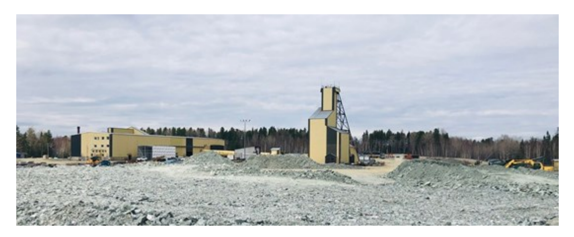
Figure 5: Photos of Beacon Mill and Property currently under care and maintenance

To view an enhanced version of this graphic, please visit: <a href="https://images.newsfilecorp.com/files/6526/223993">https://images.newsfilecorp.com/files/6526/223993</a> 7b16b73d74abb82b 007full.jpg