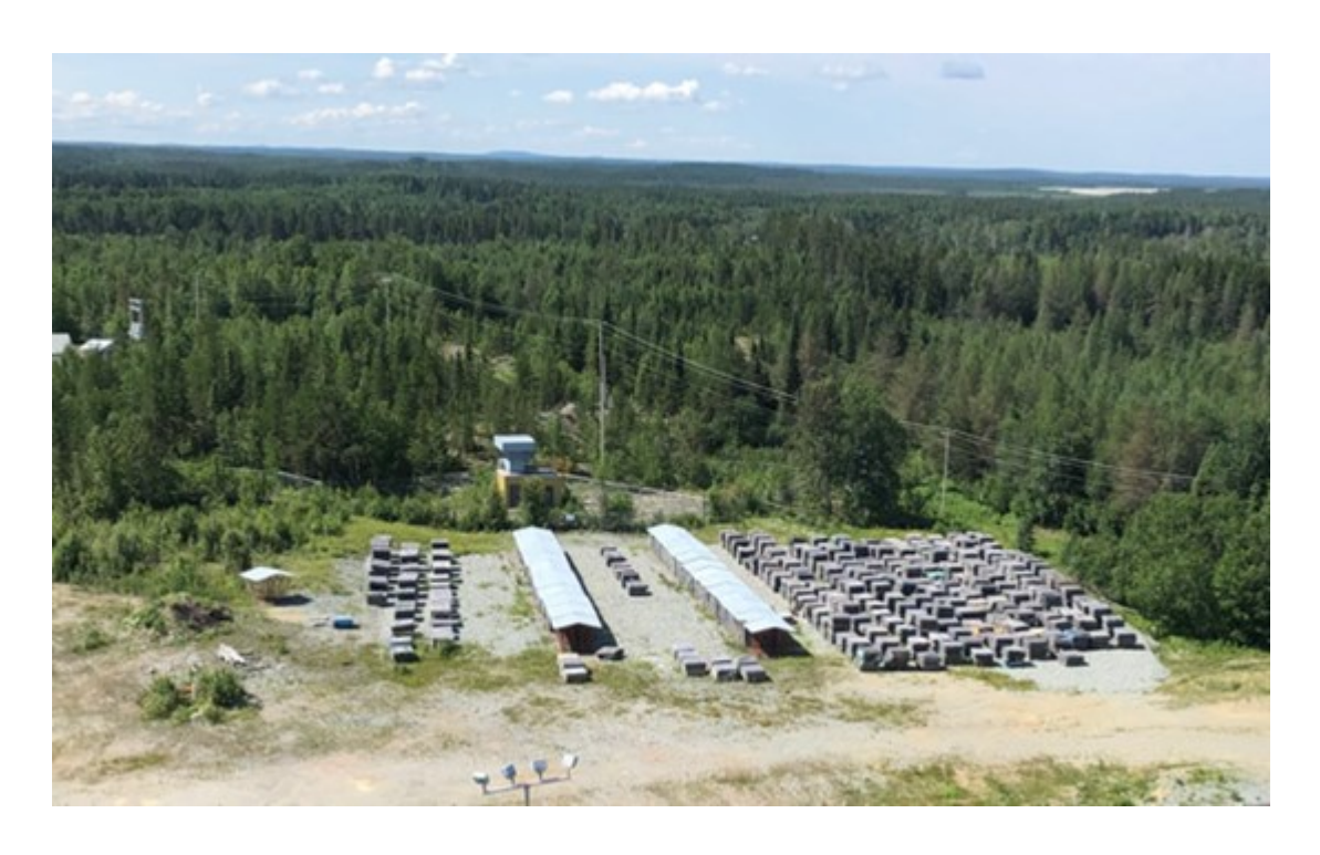
Figure 3: Photos of Beacon Mill and Property currently under care and maintenance

To view an enhanced version of this graphic, please visit: <a href="https://images.newsfilecorp.com/files/6526/223993">https://images.newsfilecorp.com/files/6526/223993</a>_7b16b73d74abb82b_003full.jpg