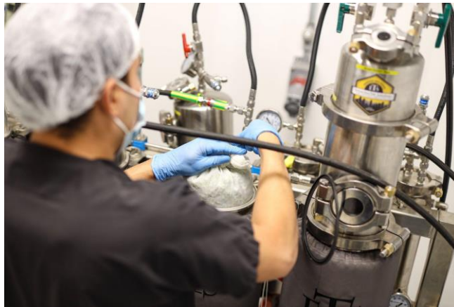
City Trees concentrate products achieved significant retail-level category growth in June 2021

LAS VEGAS, NV August 10, 2021 -- CLS Holdings USA, Inc. (OTCQB: CLSH) (CSE: CLSH), the "Company" or "CLS", a diversified cannabis company operating as Cannabis Life Sciences, today announced category performance results for its branded division, City Trees, for the month of June 2021. Compared to overall market data for Nevada, as reported by BDS Analytics, City Trees' concentrate category achieved a 153.2% increase in the number of units sold at the retail level in June 2021 compared to June 2020.