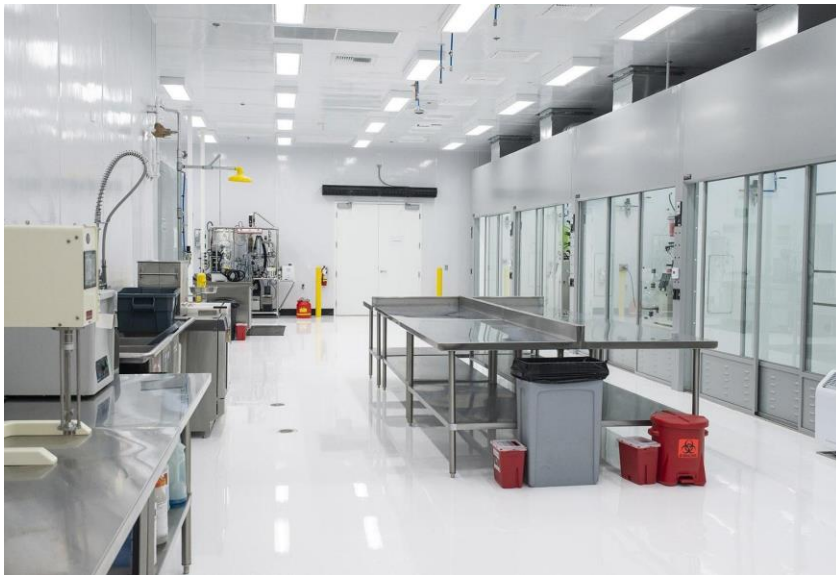
Photo: City Trees production facility, Las Vegas, NV

Founded in 2017, City Trees is a Nevada-based cannabis cultivation, production and distribution company. Offering a wide variety of products with consistent results, City Trees products are available in numerous dispensaries throughout the state of Nevada. https://citytrees.com