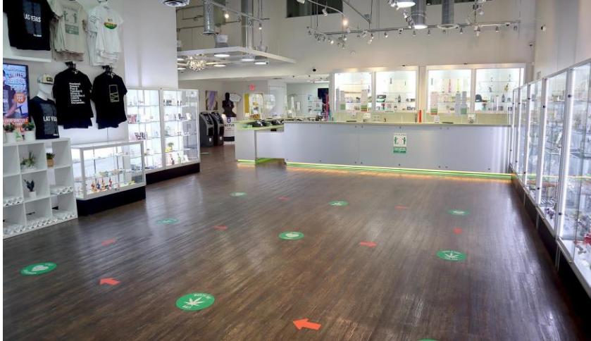
Photo: Oasis Cannabis Dispensary. Las Vegas, NV