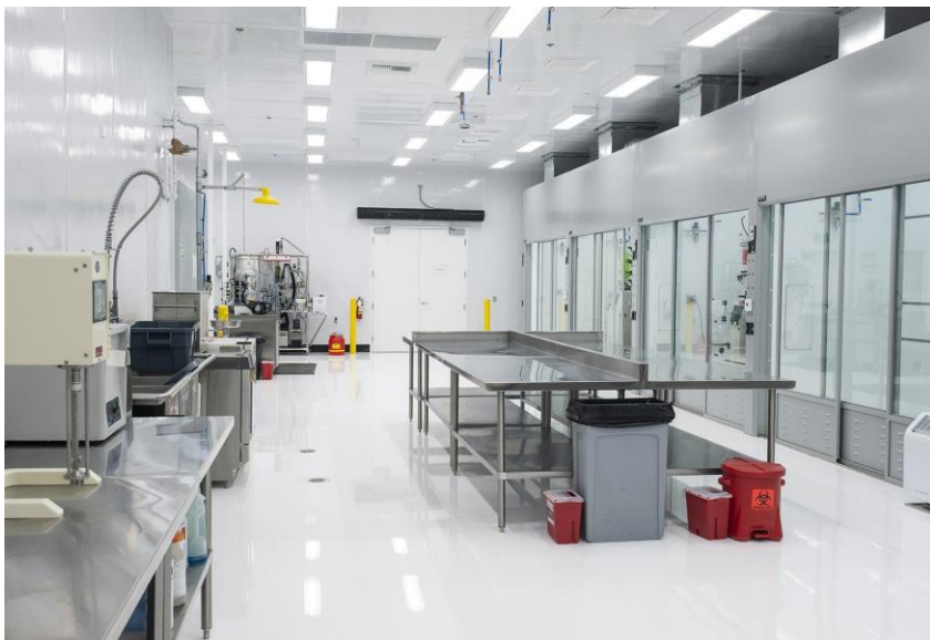
Photo: City Trees production facility, Las Vegas, NV

Founded in 2017, City Trees is a Nevada-based cannabis cultivation, production and distribution company. Offering a wide variety of products with consistent results, City Trees products are available in numerous dispensaries throughout the state of Nevada. https://citytrees.com