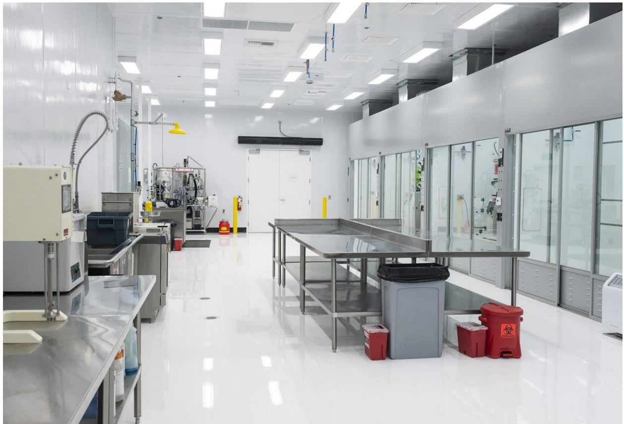
Photo: City Trees production facility, Las Vegas, NV

Founded in 2017, City Trees is a Nevada-based cannabis cultivation, production and distribution company. Offering a wide variety of products with consistent results, City Trees products are available in numerous dispensaries throughout the state of Nevada. https://citytrees.com