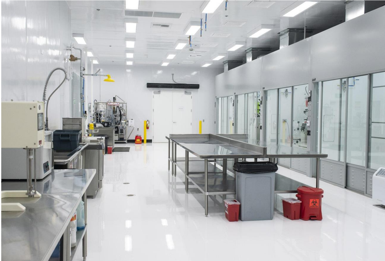
Photo: City Trees production facility, Las Vegas, NV