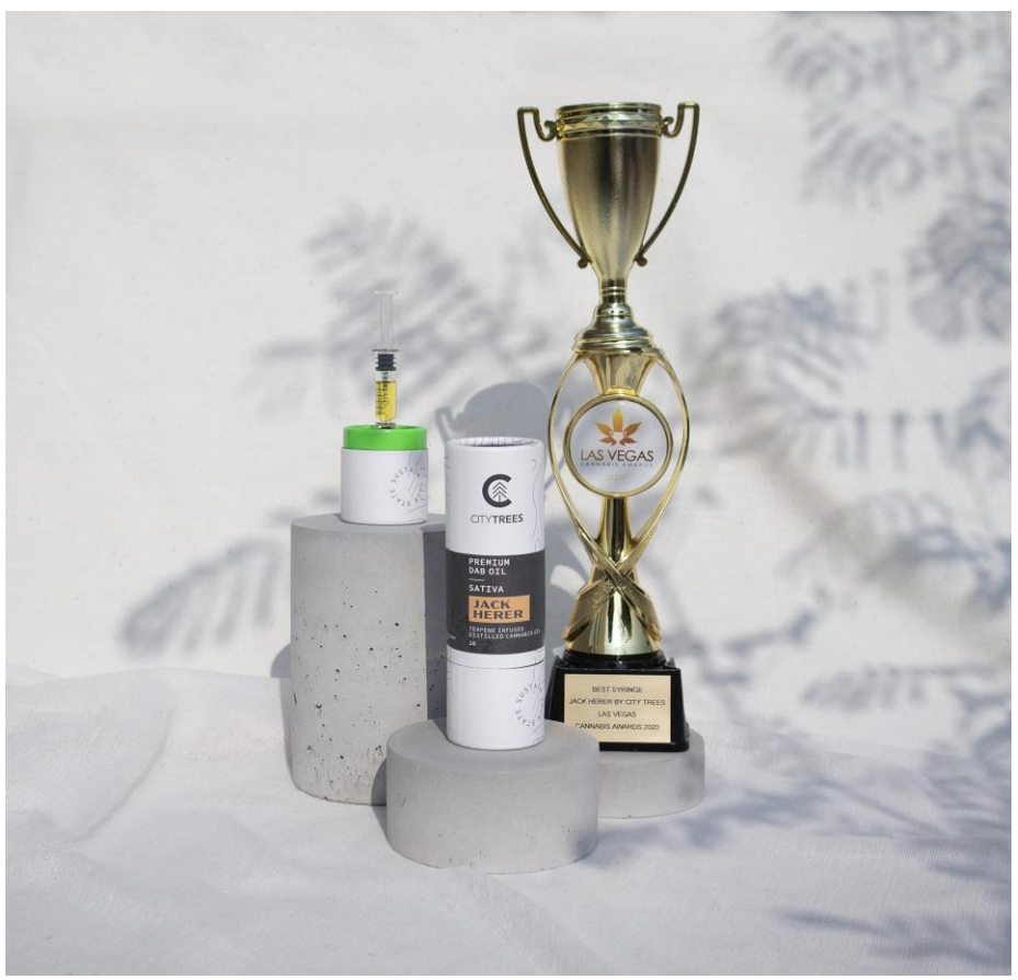
Las Vegas Cannabis Award winning Jack Herer Distillate Oil, 17 September 2020

City Trees was also honored at the Las Vegas Cannabis Awards on September 4, 2020, where it was presented with the first place prize for 'Best Syringe' for its Jack Herer distillate oil. Alongside two prizes in the 2019 High Times Nevada Cannabis Cup, this latest honor is the third industry award for the brand in the last year.