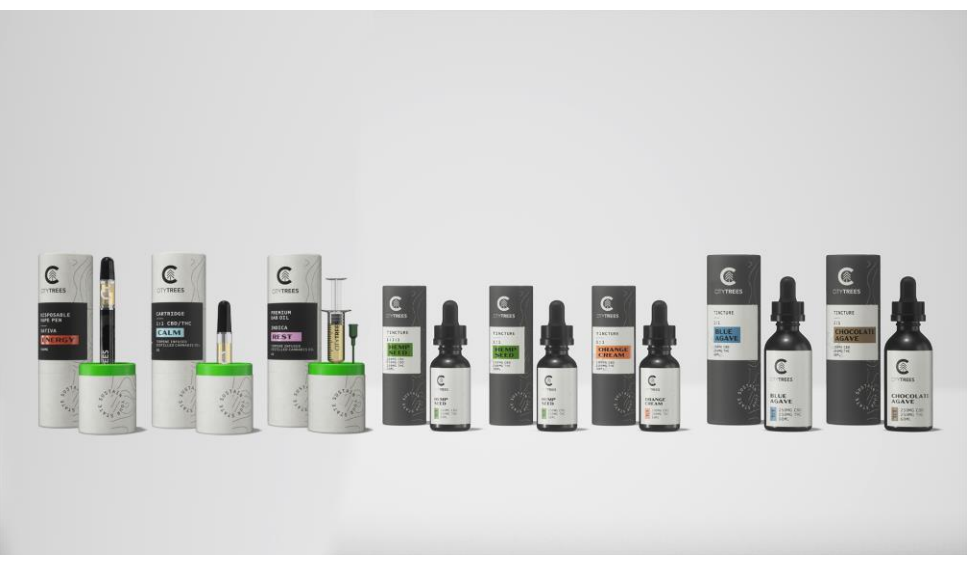
New City Trees sustainable product packaging, Las Vegas NV, 17 September 2020

In September 2020, CLS' Nevada wholesale manufacturing division, City Trees, successfully rolled out its new range of product packaging, featuring refined design criteria, recycled materials, and soy-based inks. These sustainability-minded improvements were applied to City Trees' full range of offerings, including three premium limited edition products released in alignment with its other rebranding efforts. Alongside its expanded support of the Arbor Day Foundation with its new Buy 1 Plant 1 campaign, these upgrades to City Trees' product offerings place this division at the forefront of the growing craft cannabis movement and position this brand as a Nevada industry leader in sustainability.