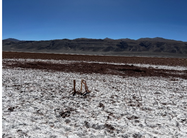
Fig 2 Drill Location for Pocitos 2 on Pocitos Salar