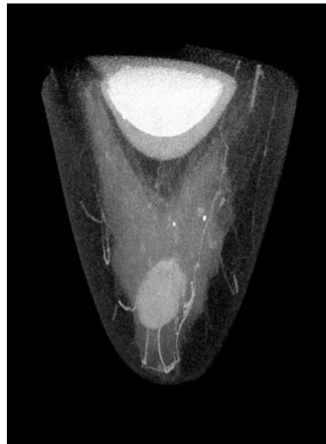
3D Breast CT