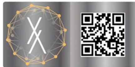
Viewing Angle 2