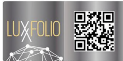
Viewing Angle 1