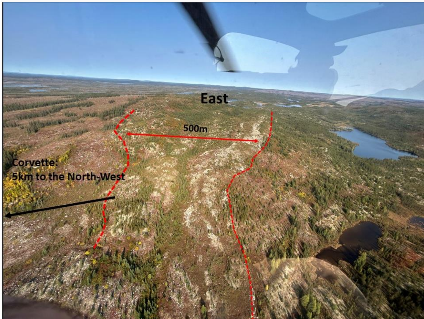
Figure 3 - View to the east of Block “C” Pegmatite Complex.