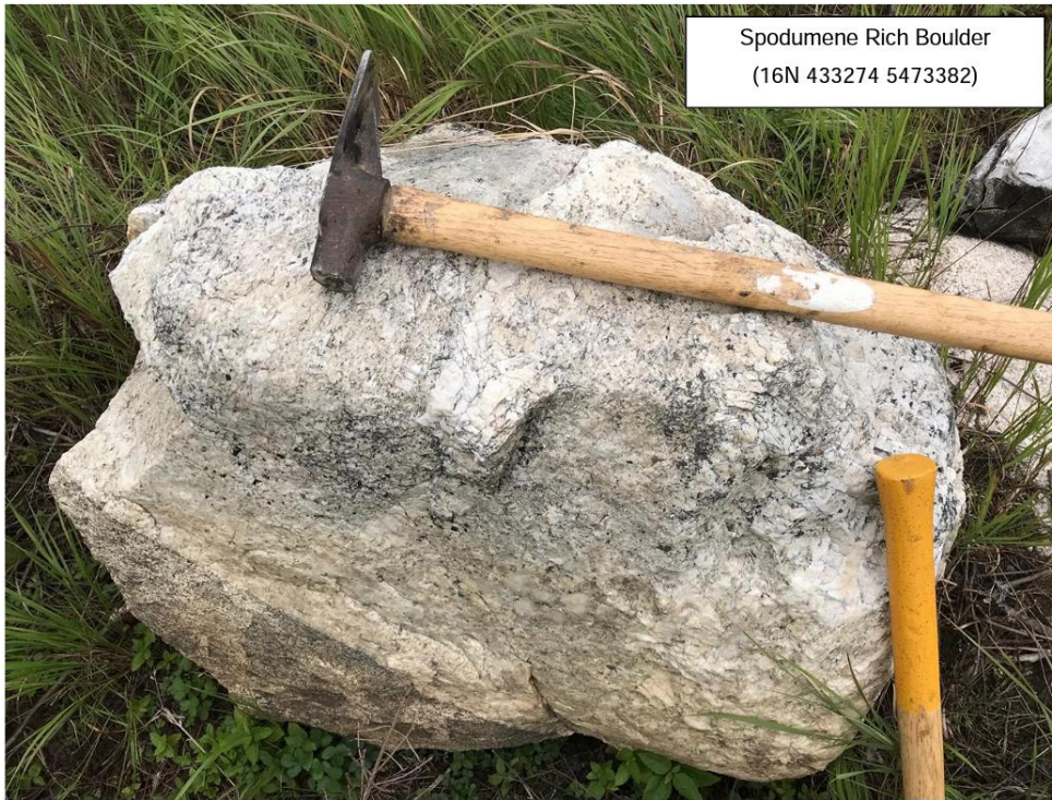
Figure 3: Spodumene bearing pegmatite boulder from the North Nipigon Project (Ontario Geological Survey AFRI 20000019444)