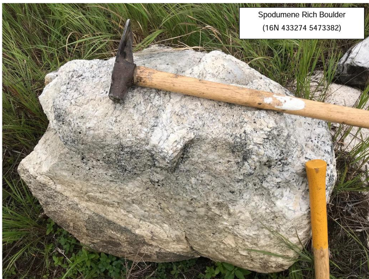
Figure 2: Spodumene bearing pegmatite boulder from the North Nipigon Project (Ontario Geological Survey AFRI 20000019444)

Under the Agreement, SPOD will acquire the Sellers' undivided 100% interest in and to the Property by making an aggregate cash payment of $65,000 and by issuing an aggregate of 4,000,000 Class A common shares of SPOD (each, a " Share ") to the Sellers on the closing date under the Agreement. The Shares issued under the Agreement will be issued at a price of $0.225 per Share and will be subject to a four month hold period pursuant to applicable securities laws.