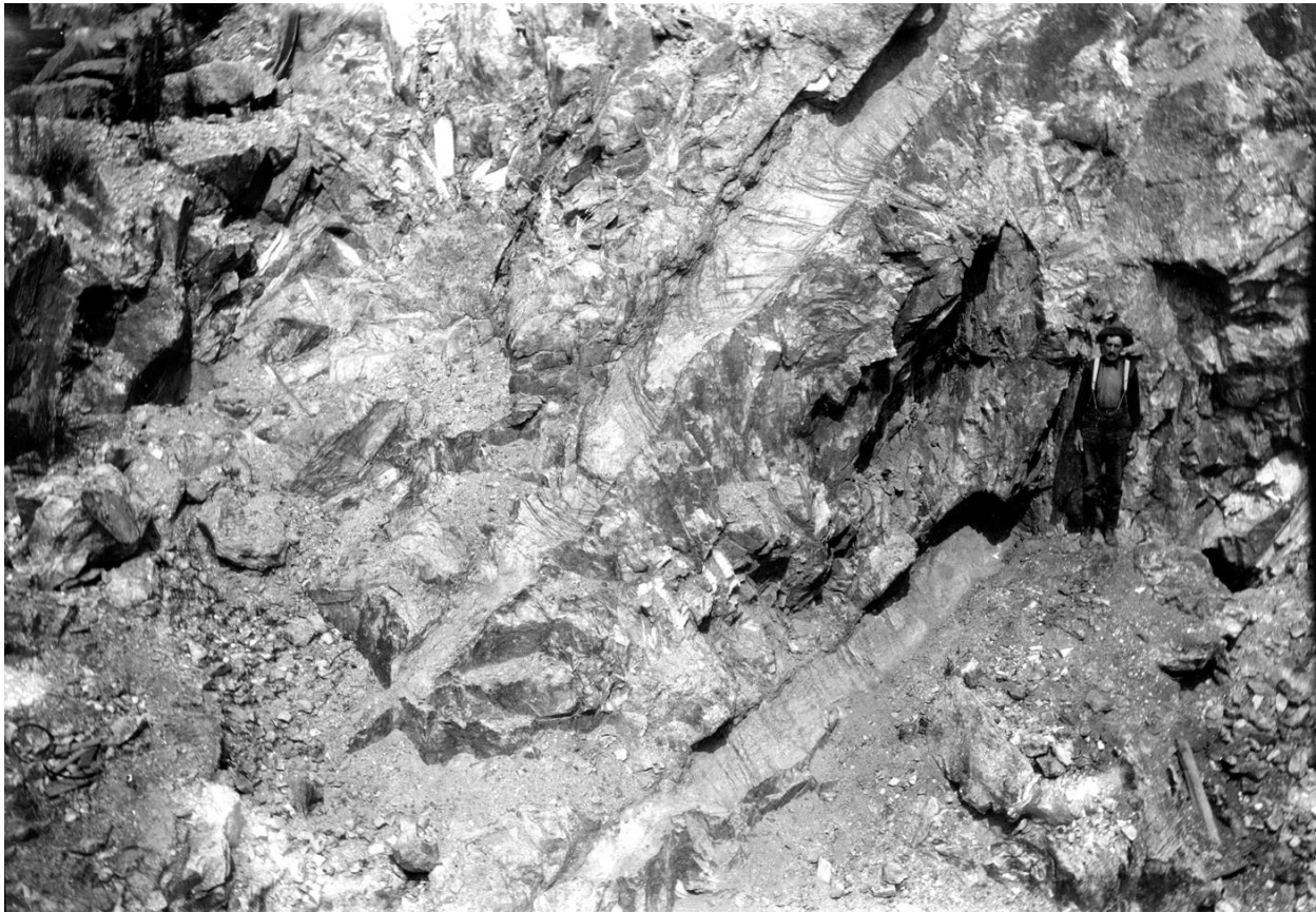
Photos 1 Gigantic crystals of Spodumene (1904) — molds of two immense crystals (for size comparison see mine worker in center of right side of photo). Etta Mines — Black Hills, Pennington County, South Dakota. Plate i-B in U.S. Geological Survey. Bulletin 610. 1916.

All claims still require final approvals from the Bureau of Land Management.