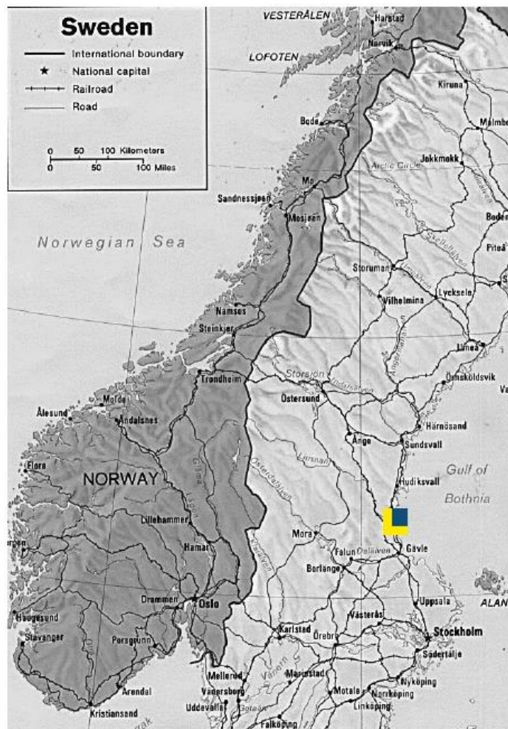
Figure 3- Bergby Property Location - Sweden

The Bergby lithium project, located in central Sweden, 25km north of Gavle, was staked in 2016 and consists of three exploration permits covering a total of 1903Ha. A prospecting campaign with mapping and sampling was undertaken and identified an extensive lithium-mineralized spodumene pegmatite boulder field and outcrops. The discovery was followed up with two separate drilling campaigns in 2017 totaling 1525m of drilling through 33 drill holes to a maximum depth of 131.1m over an approximate 1500m strike length along intersections of potential lithium mineralization.