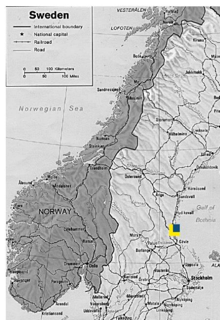
Figure 1- Bergby Property Location - Sweden

The Bergby lithium project, located in central Sweden, 25km north of Gavle, was staked in 2016 and is consists of three exploration permits covering a total of 1903Ha. A prospecting campaign with mapping and sampling was undertaken and identified an extensive lithium-mineralized spodumene pegmatite boulder field and outcrops. The discovery was followed up with two separate drilling campaigns in 2017 totaling 1525m of drilling through 33 drill holes to a maximum depth of 131.1m over an approximate 1500m strike length along intersections of potential lithium mineralization.