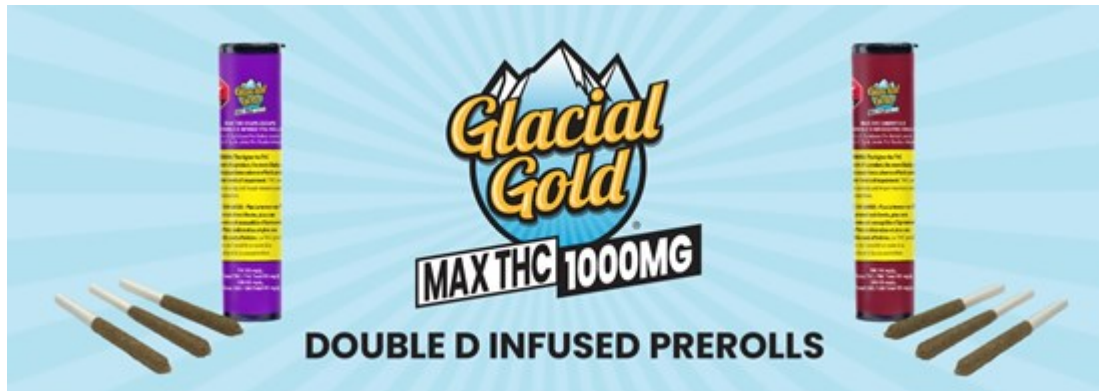
New Glacial Gold Infused Prerolls

Glacial Gold MAX THC Double D Infused Prerolls feature high potency whole dried flower infused with premium botanically flavoured distillates and spiked with THCA diamonds. They contain 44-48% THC content, with up to 1000 mg of THC per package.