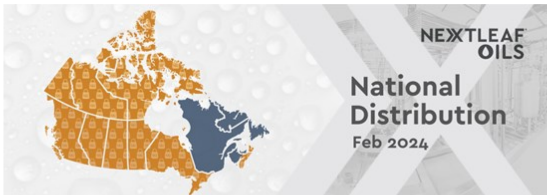
Nextleaf Oils National Distribution

With Manitoba being home to 200+ authorized adult-use cannabis retail stores serving approximately 1.4 million people, and the Northern Territories boasting a combined 16 retail stores considered destination shops, Nextleaf is well positioned for significant market penetration and growth.