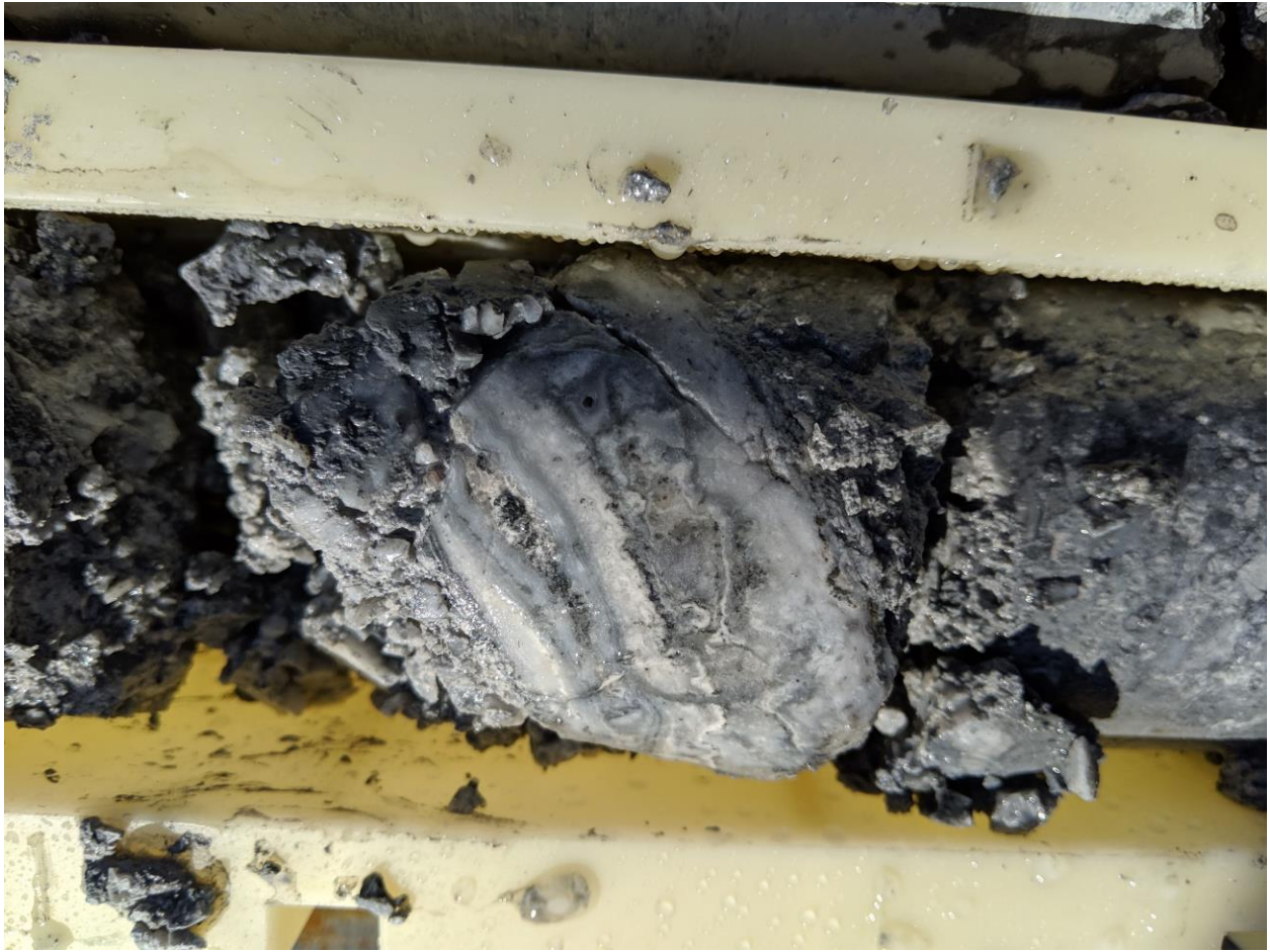
(Figure 5: Banded quartz-sulfide vein from approximately 187.7 m in hole 19OMS-002)