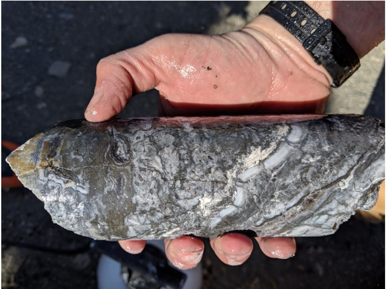
(Figure 3: Banded quartz-sulfide vein from approximately 185 m in hole 19OMS-002)