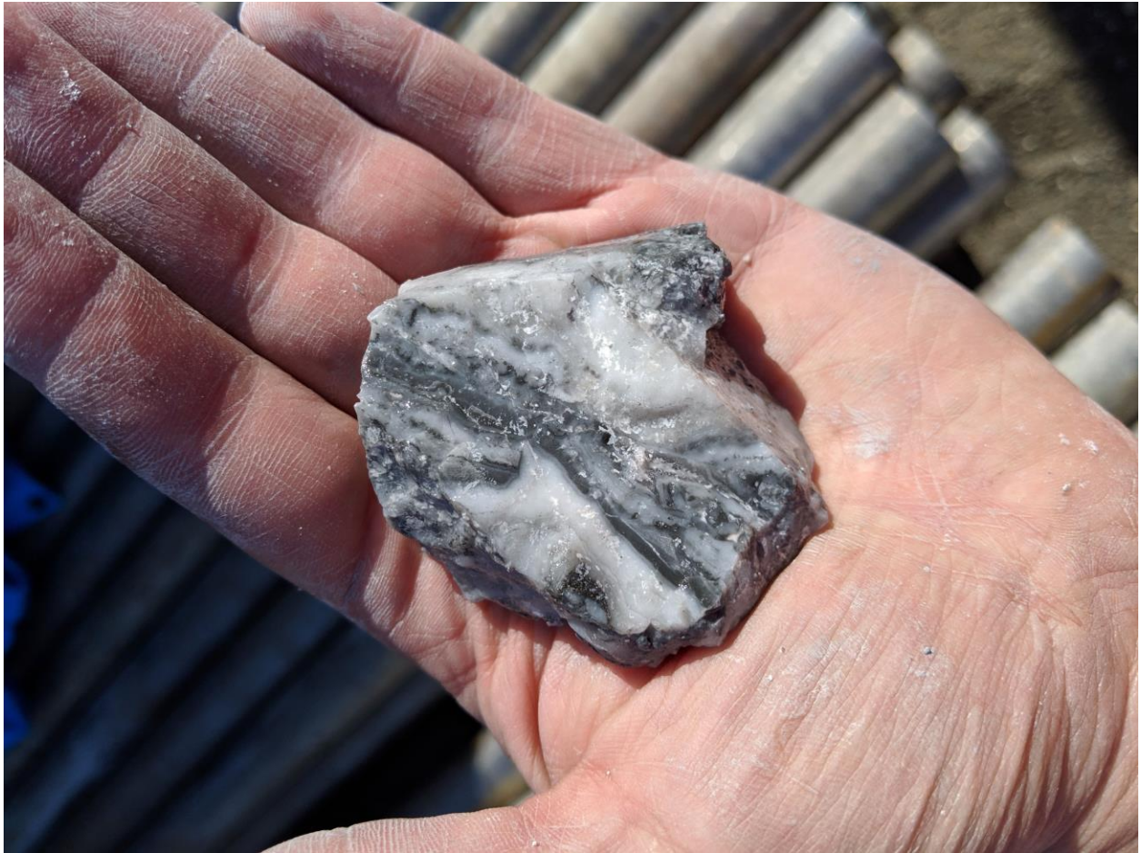
(Figure 4: Banded quartz-sulfide vein from approximately 187 m in hole 19OMS-002)