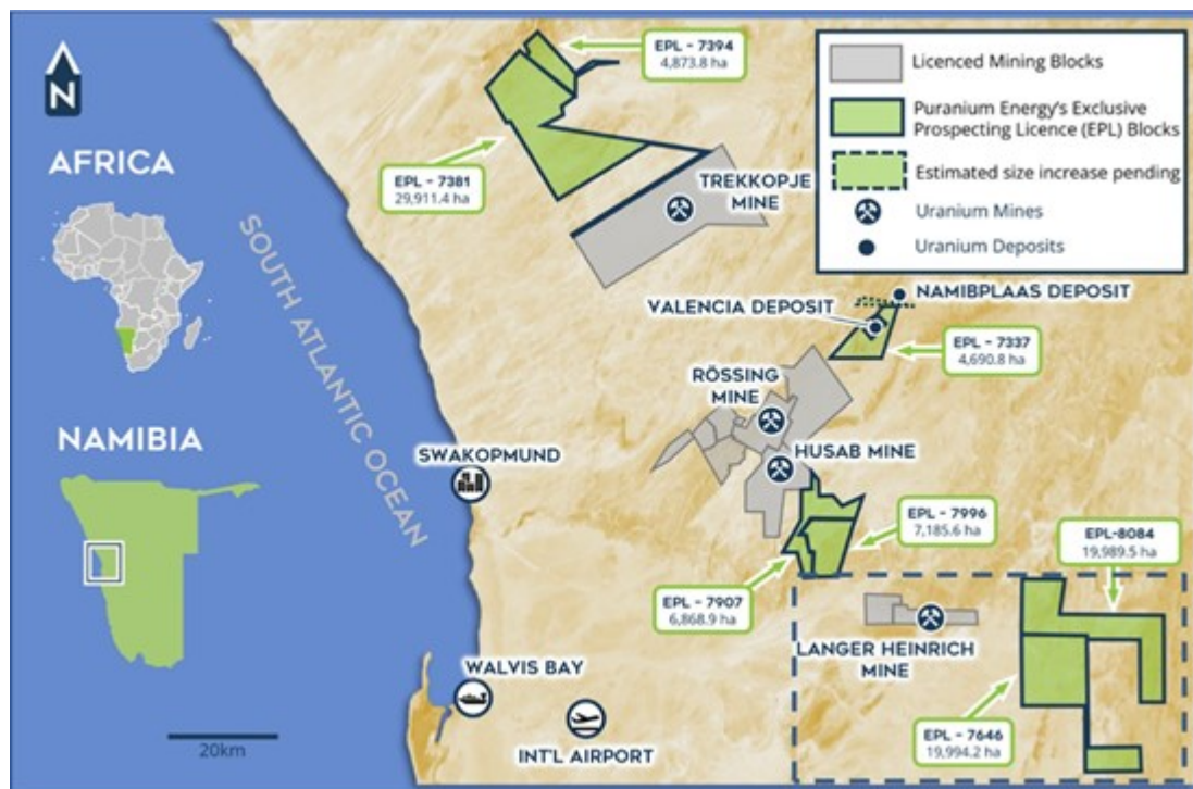
Figure 1 - Puranium Property Map

To view an enhanced version of this graphic, please visit: https://images.newsfilecorp.com/files/8575/143139_img1.jpg