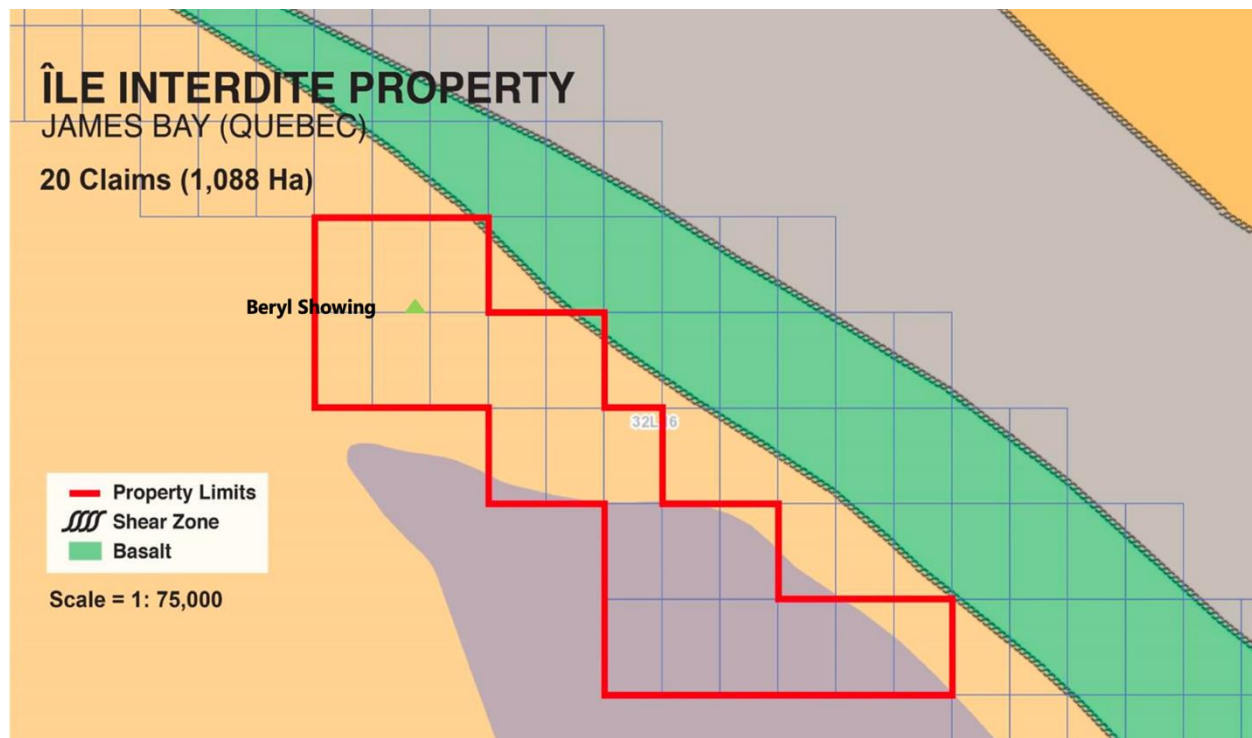
Figure 2: Ile Interdite Property

The Ile Interdite property hosts an important beryl showing that was identified in the 1960's by the same group of Quebec government geologists who reported spodumene at both Whabouchi and Cyr deposit's locations. Beryl is a relatively rare pathfinder mineral for lithium, often observed in pegmatites. At Ile Interdite, beryl is disseminated in a pegmatite.