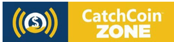
Fig 1. CatchCoin Coins Location Image

The merchant’s involvement can be key to the success of the campaign. For example, CatchCoin’s backend campaign control management system allows merchants to specify when and where Coins will appear, allowing them to incentivize user traffic at optimal times and locations. Merchants may also tailor their campaign notification settings and metrics to target specific customers at specific times, based on customer demographics or location. These settings can be updated and changed by the merchant at any time.