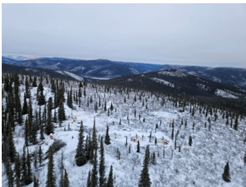
Figure #1 Shows the Alotta camp in the foreground and the drill site in the distance. Light tree coverage allows for simplified logistics.

To view an enhanced version of this graphic, please visit: