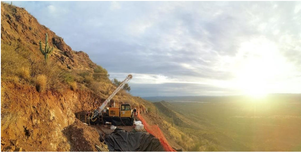
Benjamin Hill Inaugural Drill Location in Memory of David Jones

The geophysical work consists of an Induced Polarization and Resistivity survey useful at detecting geophysical anomalies underground at depths of up to 280m from surface. The main objective of this survey is to locate and define geophysical anomalies that indicate the subsurface vertical and lateral continuity of surface mineralization and hydrothermal alteration. The survey will provide confirmation of drilling targets that have been extrapolated into the subsurface through detailed geological mapping and geochemistry. Additionally, the survey may also provide information on the properties source of mineralization, a buried fertile pluton and could daylight yet unknown areas of additional mineralization.