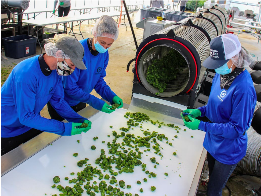
Christina Lake Cannabis team members are pictured above preparing freshly harvested cannabis plants for further processing and refinement.

Readers using news aggregation services may be unable to view the media above. Please access SEDAR or the Investor Relations section of the Company's website for a version of this press release containing all published media.