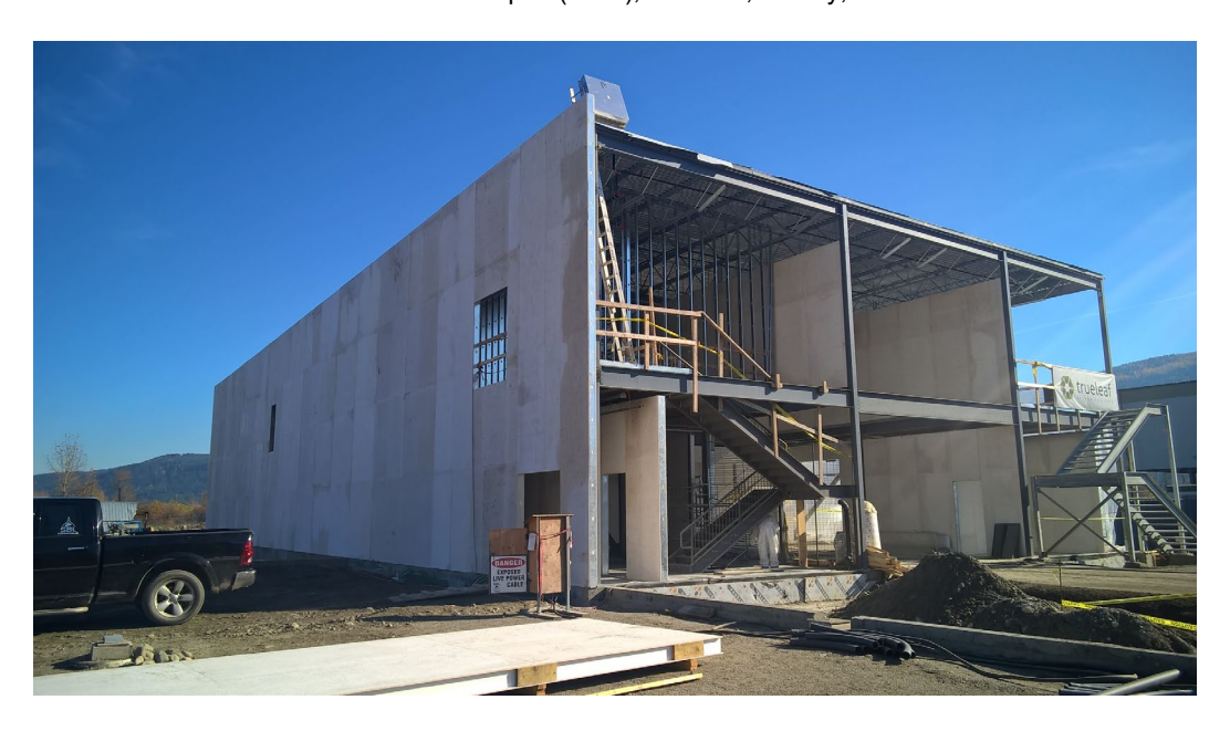
True Leaf Campus (as of Oct 19, 2018), Phase 1, Lumby, B.C

We expect to finish the construction of our Lumby facility in the fall of 2018. Our application to become a licensed producer or grower of cannabis under the ACMPR will be migrated to the CTLS under the Cannabis Act for review and approval. We also plan to apply for a license to sell cannabis products pursuant to standard processing techniques. We anticipate securing both licenses by the end of 2019.