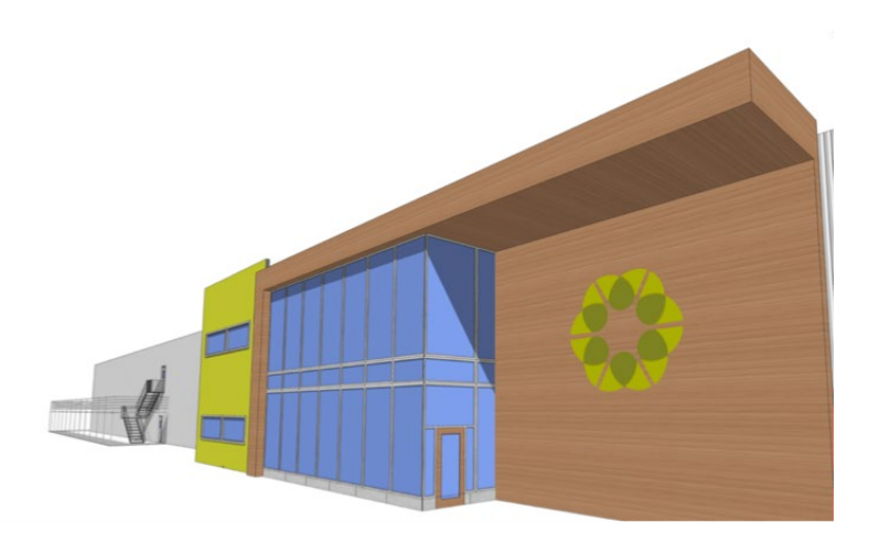
True Leaf Campus (Final), Phase 1, Lumby, B.C