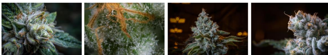
Figure 2: Keylime Kush by Lotus Cannabis Co.™