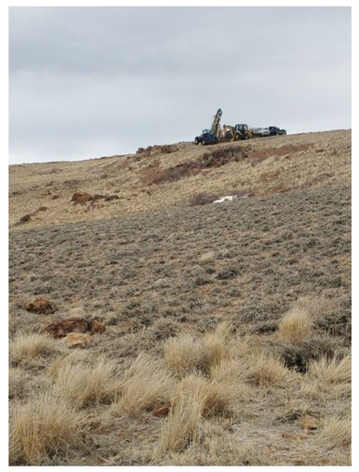
Figure 2 - Drilling newly discovered feeder zone on central ridge at White Rock. The zone projects open-endedly across the core mineralized area.

To view an enhanced version of Figure 2, please visit: <a href="https://orders.newsfilecorp.com/files/5654/101983">https://orders.newsfilecorp.com/files/5654/101983</a> fig2.jpg