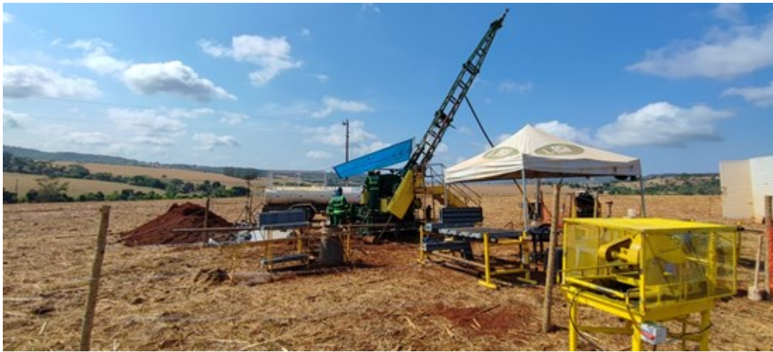
Figure 1 - Diamond Drillhole PCH-DDH-002 on Target IV highgrade area. Click here for short video of project area.

Toronto, Ontario--(Newsfile Corp. - October 23, 2024) - Appia Rare Earths & Uranium Corp. (CSE: API) (OTCQX: APAAF) (FSE: A010) (MUN: A010) (BER: A010) (the " Company " or " Appia ") is excited to announce the commencement of its diamond drilling program in the southwest corner of Target IV. The goal of this program is to identify and delineate a possible Rare Earth Elements (REE) highgrade area at depth, identified by previous Reverse Circulation (RC) drilling ( See January 16 th 2024 Press Release ), associated with a carbonatitic breccia intrusion or dike.