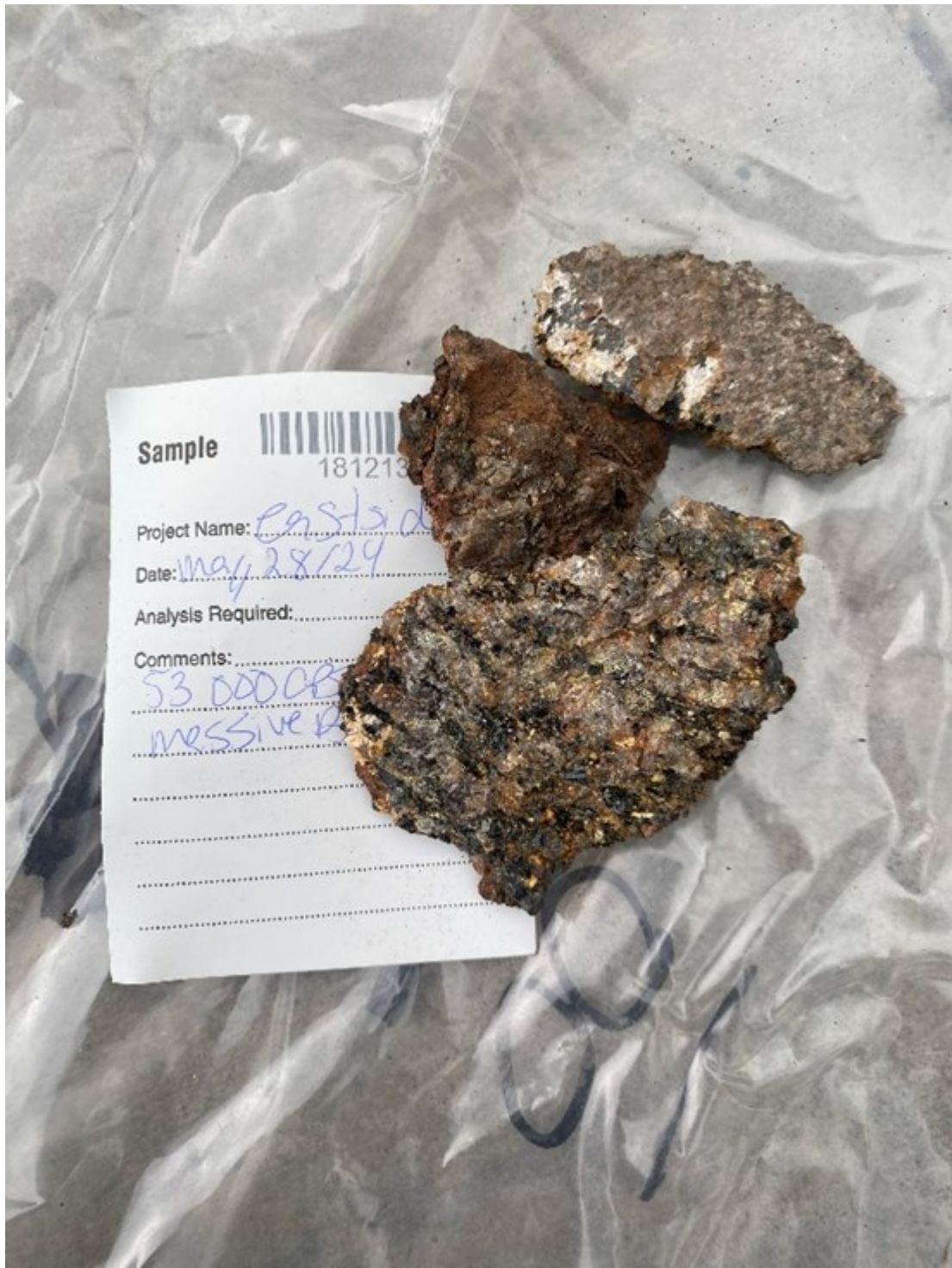
Figure 2 - Uranium sample 181213 displaying 0.25 wt% U 3 O 8 hosted within massive biotite

To view an enhanced version of this graphic, please visit: