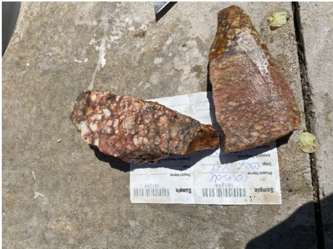
Figure 5 - Rare earth element sample 181244 displaying 0.14 wt% TREO hosted within granite

To view an enhanced version of this graphic, please visit: https://images.newsfilecorp.com/files/5416/222205_fig4.jpg