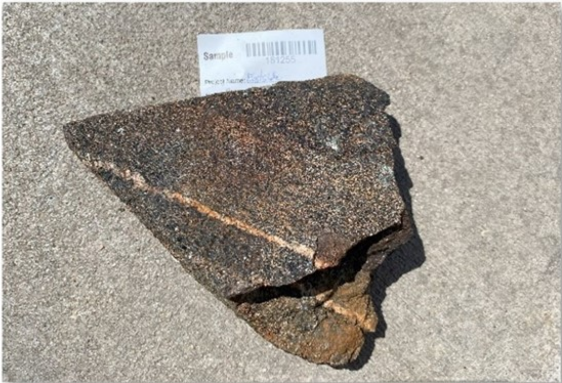
Figure 3 - Uranium sample 181255 displaying 0.07 wt% U 3 O 8 hosted within granodiorite

To view an enhanced version of this graphic, please visit: https://images.newsfilecorp.com/files/5416/222205_fig3.jpg