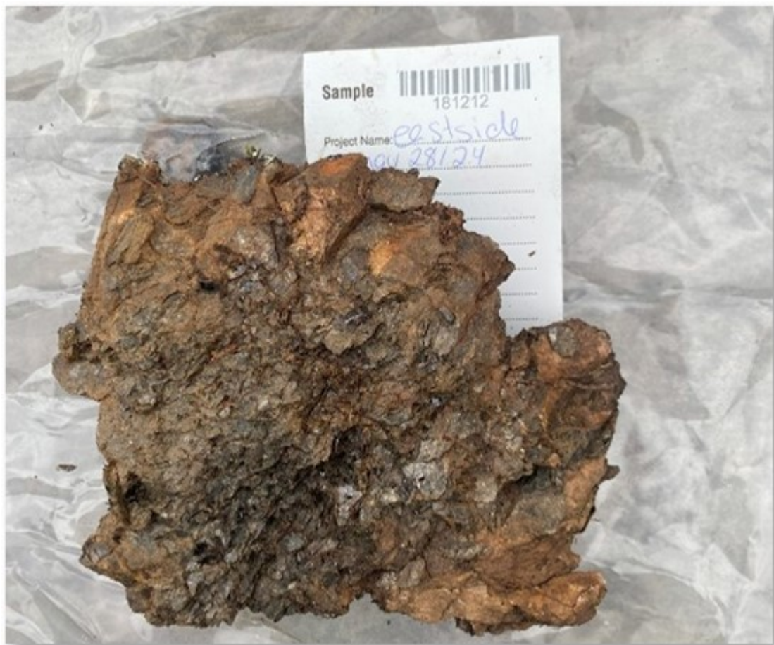
Figure 4 - Uranium sample 181212 displaying 0.06 wt% U 3 O 8 hosted within biotite-rich pegmatite

To view an enhanced version of this graphic, please visit: https://images.newsfilecorp.com/files/5416/222085_fig2.jpg