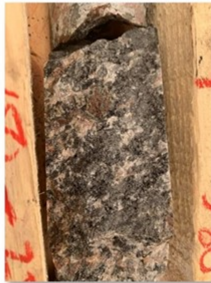
Figure 2b - Monazite-Hosted Pegmatite Intercept – 98.5m - 24-LOR-003.

To view an enhanced version of this graphic, please visit: