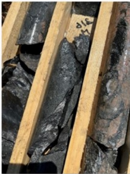
Figure 2a - Graphitic Conductor Intercept - 216m - 24-LOR-003

https://images.newsfilecorp.com/files/5416/218196_f23ee583e48c0b05_001full.jpg