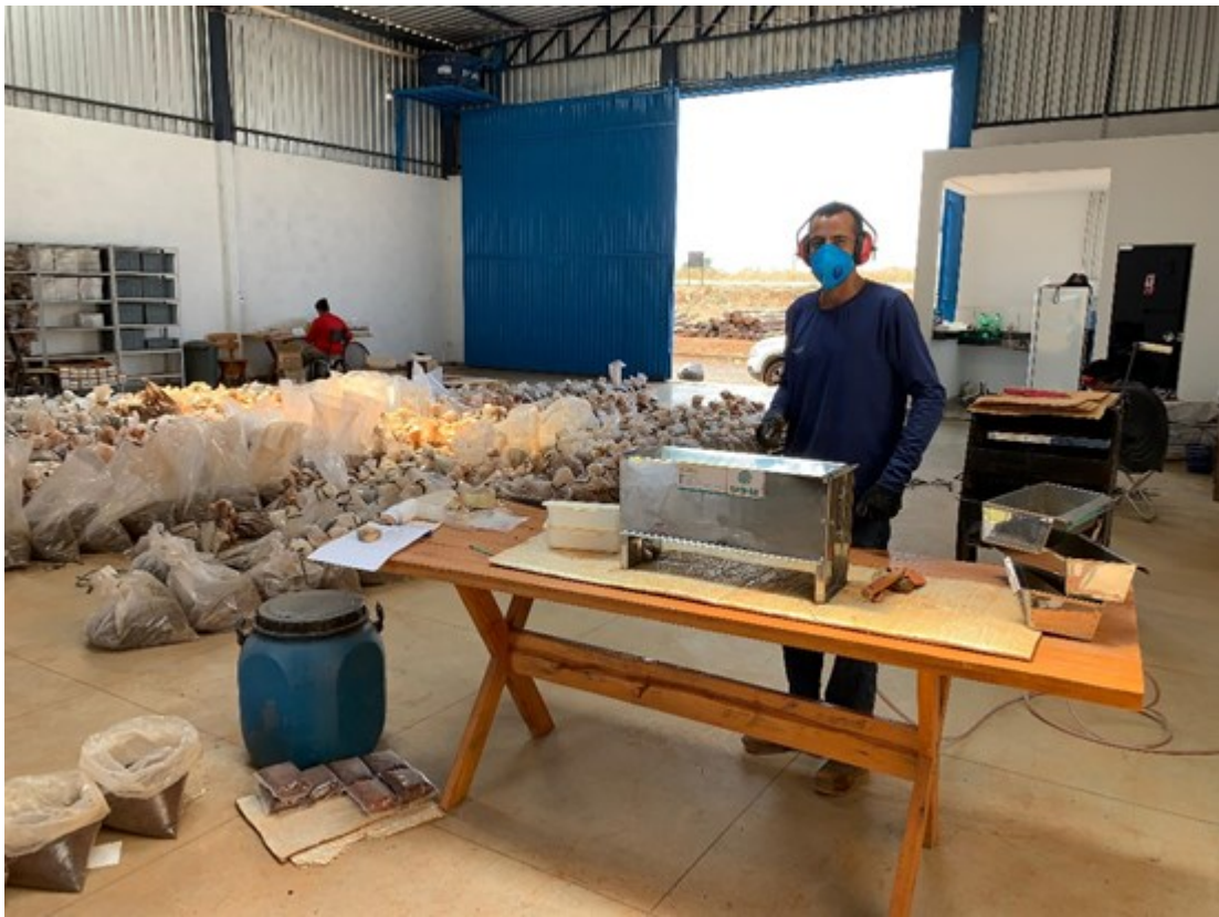
Image 1 - Technician processing samples at Appia's logging facility in Brazil.

To view an enhanced version of this graphic, please visit: