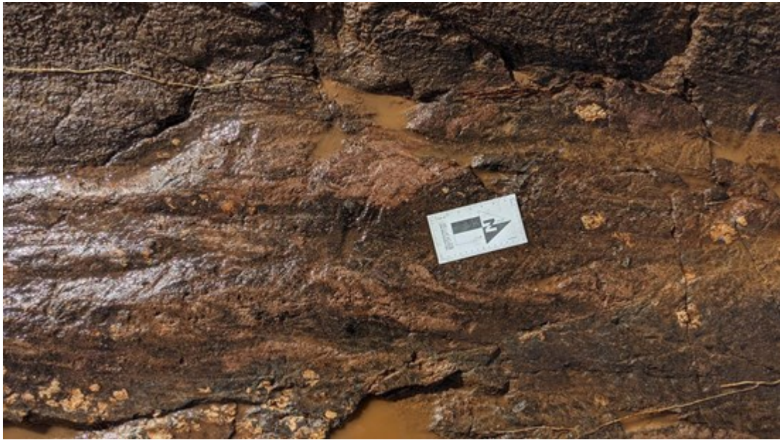
Figure 3 - Biotite-rich shear zone at SCH with "augenitic pods" of semi-massive monazite.

To view an enhanced version of this graphic, please visit: