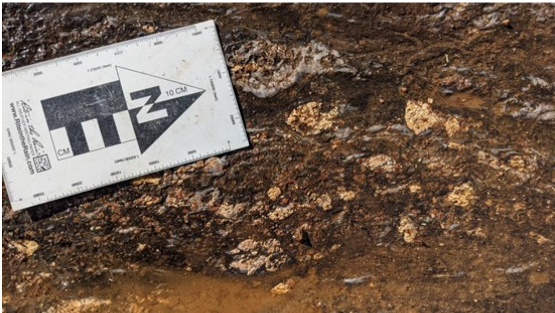
Figure 4 - Biotite-rich shear zone at SCH with coarse-grained monazite (different location than Figure 3).

https://orders.newsfilecorp.com/files/5416/93373_e8ab2e3aa4043871_007full.jpg