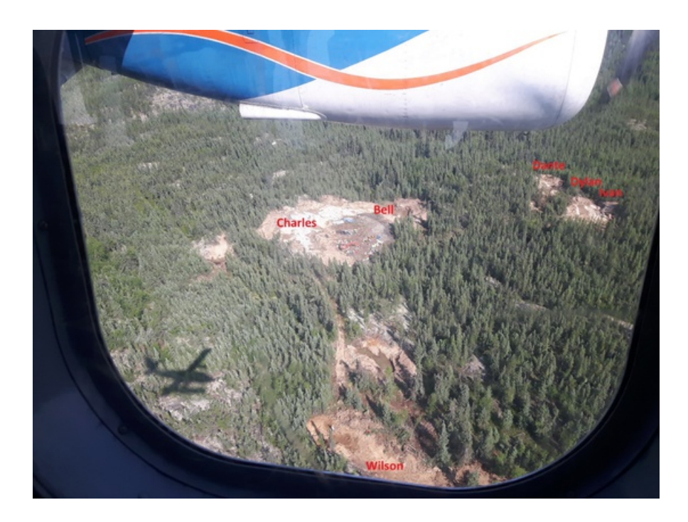
Figure 2: Aerial view of excavating to-date on 6 REE zones at Alces Lake. No scale available.

To view an enhanced version of this graphic, please visit: <a href="https://orders.newsfilecorp.com/files/5416/36317_a1533213607714_85.jpg">https://orders.newsfilecorp.com/files/5416/36317_a1533213607714_85.jpg</a>