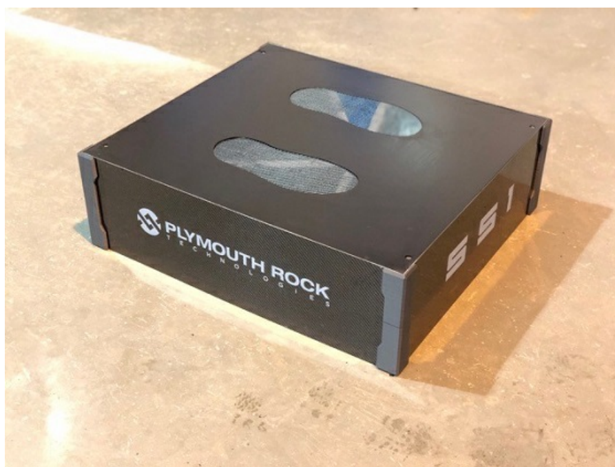
Figure 2: SS! Shoe Scanner

https://orders.newsfilecorp.com/files/5702/50297_image1.jpg