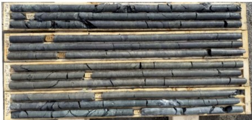
Photograph 1: Massive VMS mineralization from DDH YH22-82 111.8 to 123.0 m in D Zone

The Phase 4 drilling continued to discover and delineate copper and zinc-rich VMS mineralization both between known zones of mineralization as well as also along strike and downdip of them. The A zone was the only zone within the property that was historically mined, and until recently only one drill hole had tested this zone due to the problems of intersecting the near-surface underground workings. During the Phase 4 drilling program the Company tested the A zone with 12 drill holes. A few drill holes intersected old workings and had to be abandoned but two holes were not stopped before intersecting 1.0 to over 9 metres of VMS mineralization in drill holes YH22-105 and -107. The results show the A Zone has both near-surface mineralization adjacent to the old mine workings and that the mineralization also extends both southerly along strike and beneath the historic mine workings.