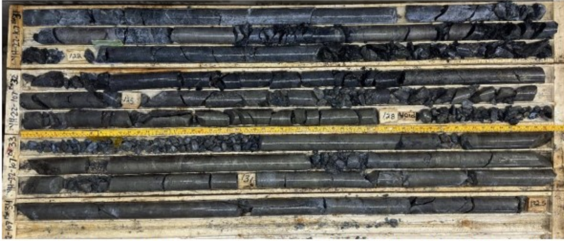
Photograph 2: Massive VMS mineralization from DDH YH22-107 124.1 to 133.1 m in D Zone

Drill hole YH22-91 situated south and east of the Main Mine zone testing an extensive IP chargeability anomaly intersected 8.8 metres of intermittent semi-massive chalcopyrite and sphalerite mineralization indicating a possible new 'South Zone' of VMS mineralization in the vicinity and southwesterly, trending towards the Pinnacle geological and geochemical exploration target.