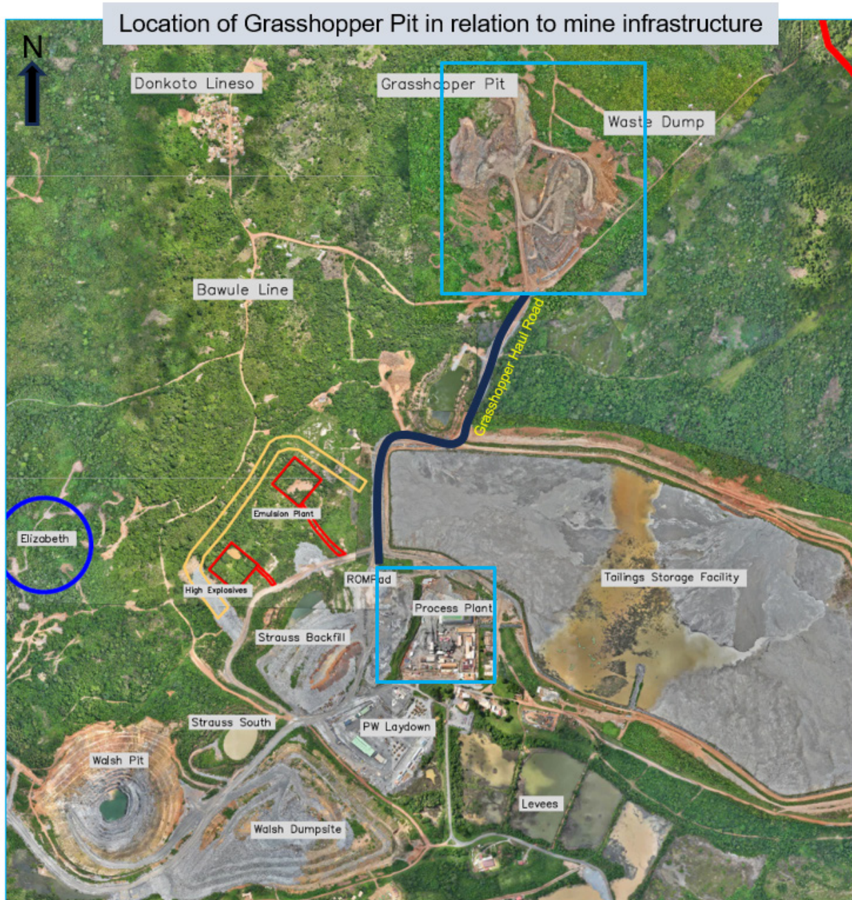
Figure 1: Lidar image of the Bibiani mine showing the Grasshopper pit in relation to mine infrastructure.