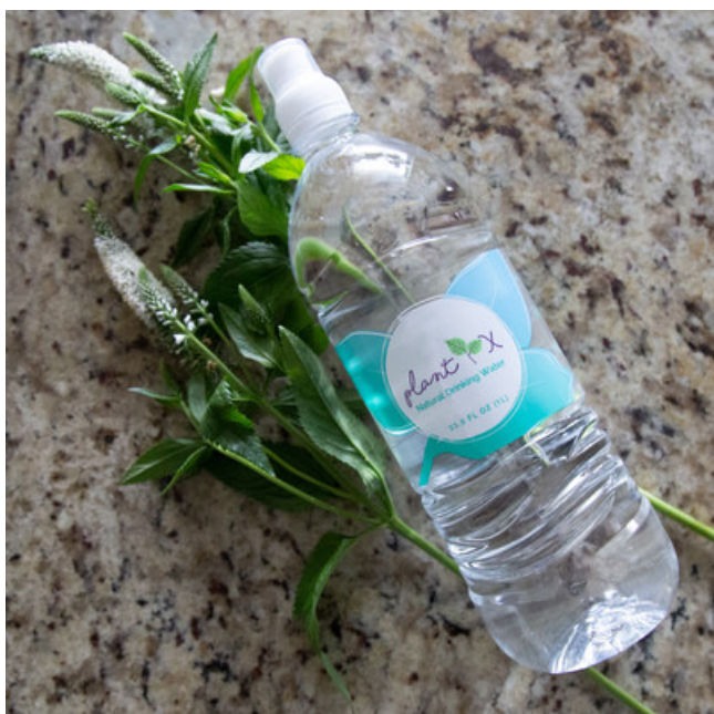
PlantX Water (CNW Group/Vegaste Technologies Corp.)

This initial sale of PlantX-branded glacial water is only the beginning of the Company's plans to expand the sale of its water throughout the continent. The Company plans to also bottle PlantX glacial water in sports bottles which will include the use of a new logo that will be distinct and unique, drawing eyes in retail locations to generate even more revenue.