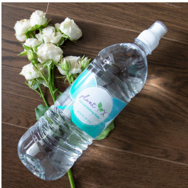
PlantX Water With Sports Cap

and nutritionists. This important commodity will bring attention to the Company's e-commerce platform. PlantX-branded water is sourced from Canadian glaciers, where the geography, climate, and geology makes them a unique and pristine source of water, and bottled with a low carbon footprint in mind.