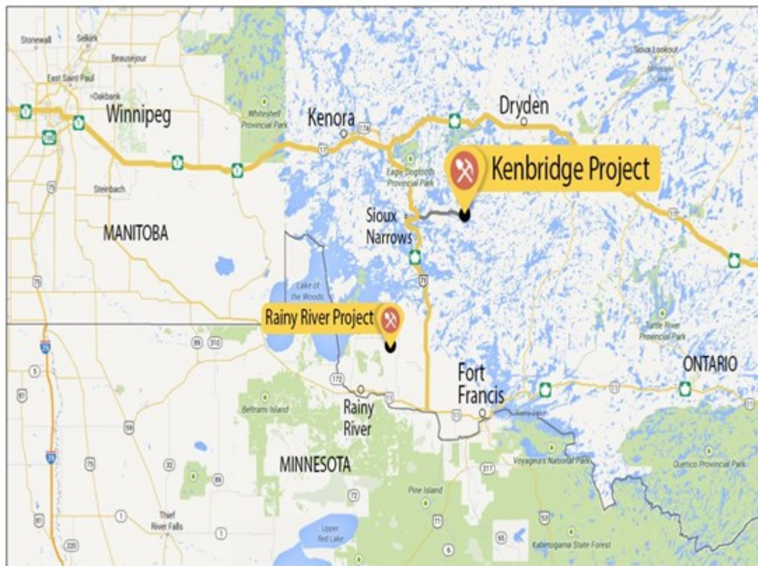
Figure 1: Location map of the Kenbridge Project.

To view an enhanced version of this graphic, please visit: