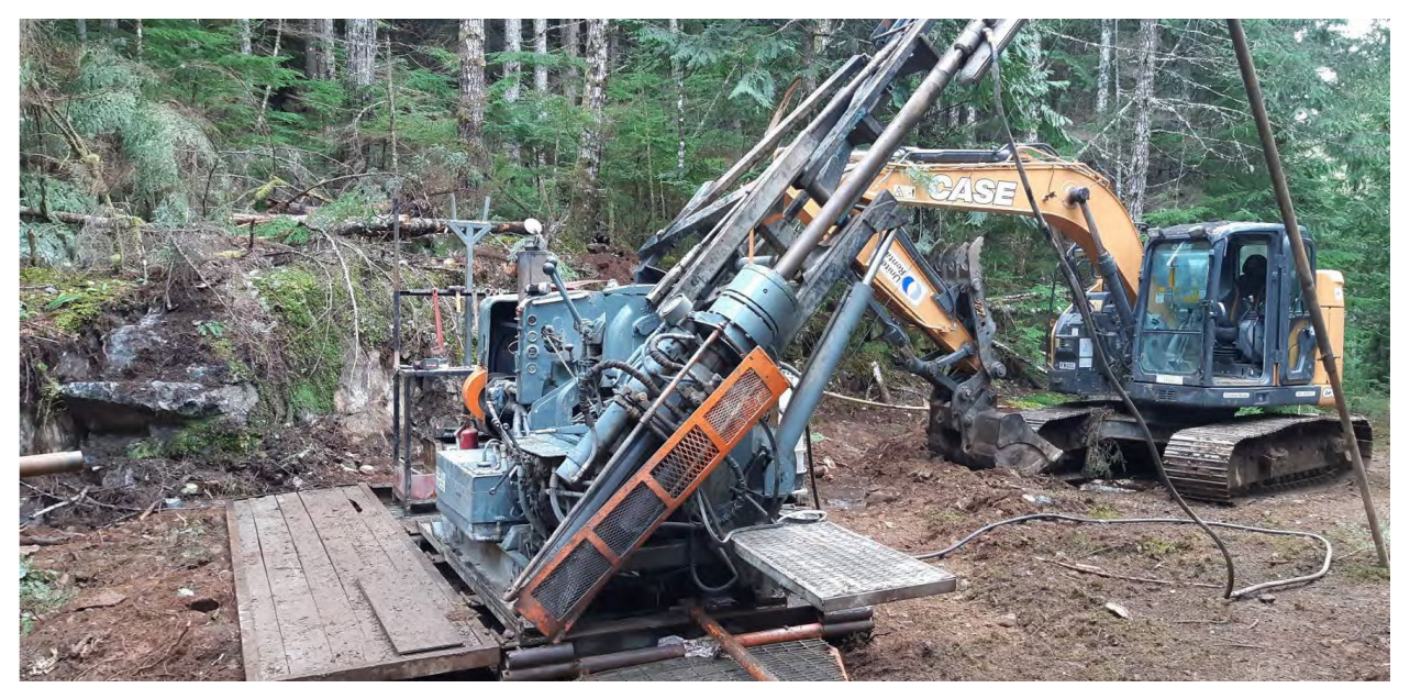
Figure 1 – Boyles 25 Diamond Drill on Setup #1 during previous drill campaign at Redonda Copper Project

Vancouver, BC – November 11<sup>th</sup>, 2024 – Recharge Resources Ltd. ("Recharge" or the "Company") (RR: CSE) (RECHF: OTC) (SL5: Frankfurt) has entered into a binding earn-in option agreement (the "Agreement") with Stamper Oil and Gas Ltd. ("Stamper" or the "Optionor") whereby Recharge may earn up to a 50% interest in the Redonda Project (the "Project"), located within the Vancouver Mining Division of British Columbia.