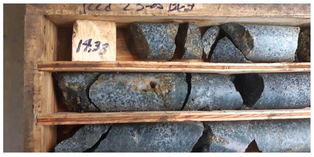
Figure 2. Hole 5 at 14.33 Meters

The Project, previously explored by Teck Resources Limited (previously Teck Corp.) ( "Teck" ) has had a total of 14 holes drilled all showing consistent values with widespread mineralization near surface. Teck drilled a total of nine NQ core holes for a total of 1,681 metres (5,515 feet) at the Project in 1979 with recent follow up drilling completed in 2023 for a total of 5 holes and 799.81m (2,624 ft.).