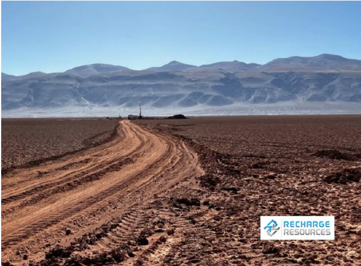
Figure 2: View of the mining road to exploration well PCT-22-01 (Pocitos I) with rig mast in background.

This is another milestone in the Company’s endeavour to build up to a 20,000-tonne Ekosolve™ direct lithium extraction plant at the Pocitos project in order to supply Richlink Capital Pty. Ltd. (“ Richlink ”) up to 20,000 tonnes of lithium carbonate per year, as previously announced under a letter of intent of offtake.