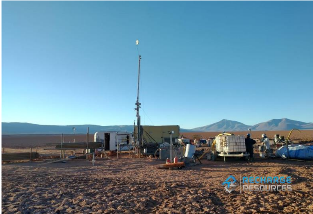
Figure 1: View of the pad and rig at Pocitos 1 in November 2022. (Pocitos)

Benchmark Minerals have confirmed in their “Trillion dollar battery” 2023 paper that there are 238 gigafactories currently producing LFP and other lithium batteries requiring an estimated three million tonnes of lithium carbonate by 2030 . There are more than 60 additional gigafactories being built to achieve a total estimated 8.9 terawatts of capacity (8,900,000,000,000 watts). The top 10 lithium producers in the world are currently producing a total of 715,000 tonnes in 2023 . This represents just 23% of the 2030 demand estimate.