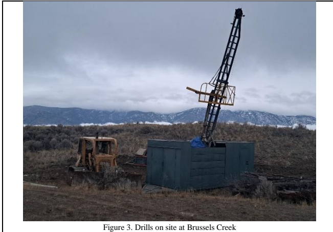
Figure 3. Drills on site at Brussels Creek